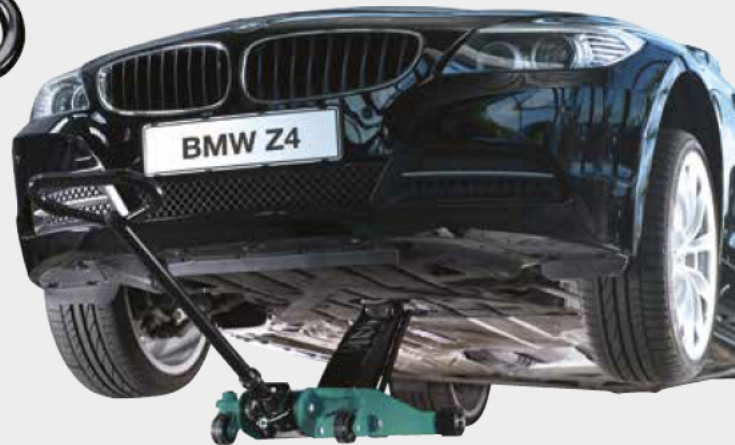
Long reach chassis improves access to lifting points deep under vehicles.