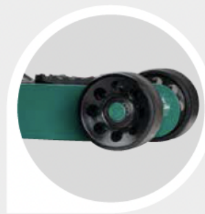
Low entry height.