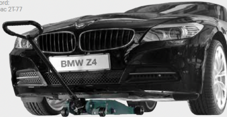
Extremely low chassis improves access under low vehicles.